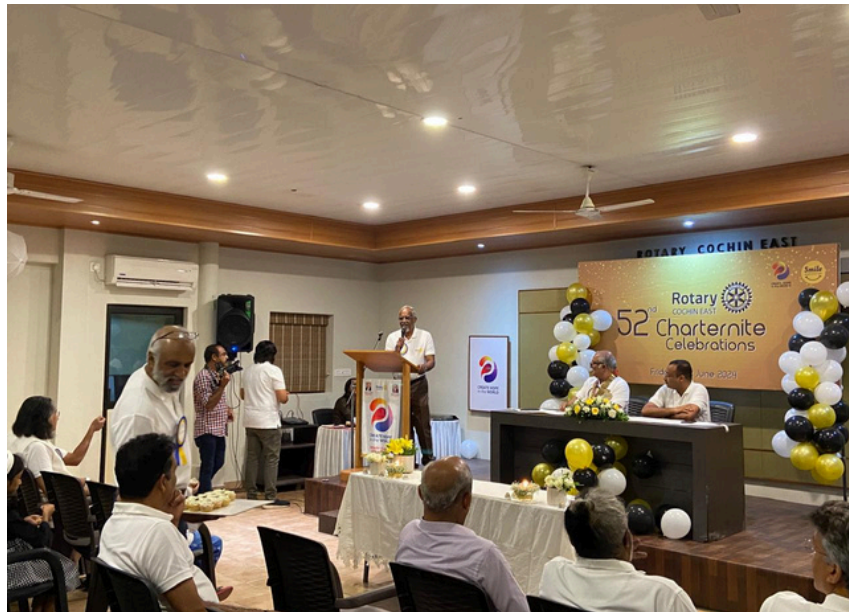
Photo of our Charter night being celebrated in the renovated hall